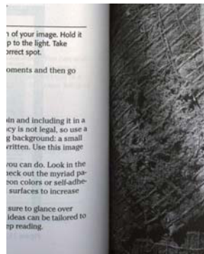
One-way LED light source - more shadows

Equipped with the two-way LED as its light source, LS-3700 can efficiently decrease shadows caused by uneven surfaces of the scanned object and therefore ensures clearness and lifelikeness of scanned images. When powered on, there is no warm-up time required for LS-3700 and it can start scanning immediately, which fits to the popular ecological trend.