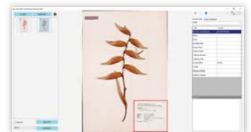
Image archive and privileged account management system

Specimen label information will be recognized and automatically saved titled by herbarium code and specimen serial number in XML format through ScanWizard-Botany. Various options, such as contrast, lightness, and sharpness, are also provided for curators on image adjustment.