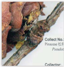
The ObjectScan 1600 Scanner

ObjectScan 1600 has a color linear CCD with resolution up to 1,600 pixels per inch, equaling that of 1Gigabyte. With the built-in 48-bit ADC (Analog to Digital Converter), the whole specimen as well as details of surface textures can be precisely captured and presented in high fidelity format.