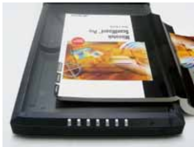
Zero Boundary design at right margin