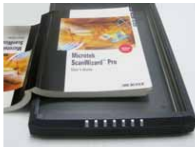
Zero Boundary design at left margin

The ScanMaker s450's patented Zero Boundary™ design eliminates the problem of scanning bound pages with text and pictures close to the inner margin of a book or magazine. You get easy-to-read text and clear images across the entire page.