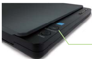
One-Touch Scan Button

A fast scan button is a smart button which enables users to start a scanning process immediately by touching a button. Set up by software, a fast smart button can fast and easily carry out functions such as scanning, printing, OCR and emailing, enhancing work efficiency and meeting with customers' needs.